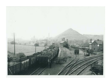
Teversal East station (GNR)