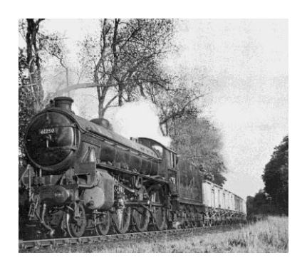
Train on Teversal GN line