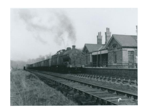
Manor station (MR) and coal train