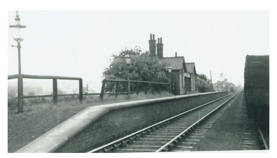
Manor station (MR)